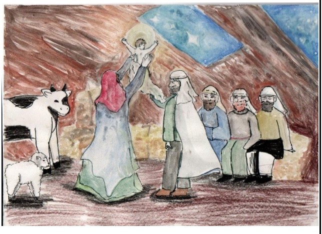
Yaryna Zakulizma Group 2