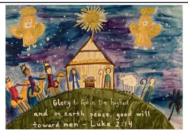
Group 2 Tabitha Shields