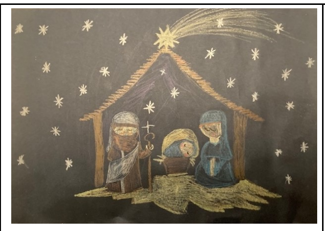
Group 1 Vida Butti